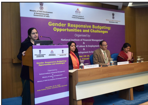
Workshop on Gender Responsive Budgeting