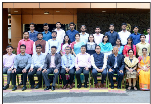
26th PTC at RBI Chennai during Domestic Attachment