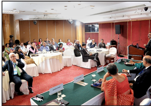
Workshop on Valuation of Equities and Related Stock Market Concepts for DIPAM