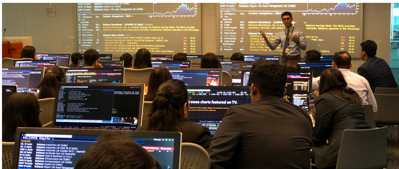
Group Photograph of PGDM (Financial Markets) 2018-19