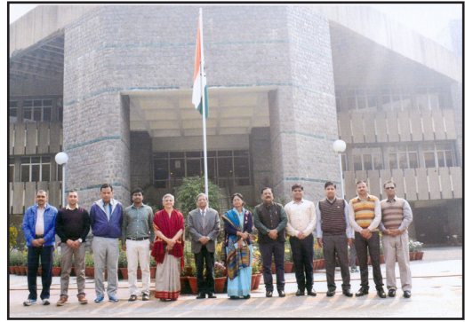
Participants of Training Programme on Public Procurement