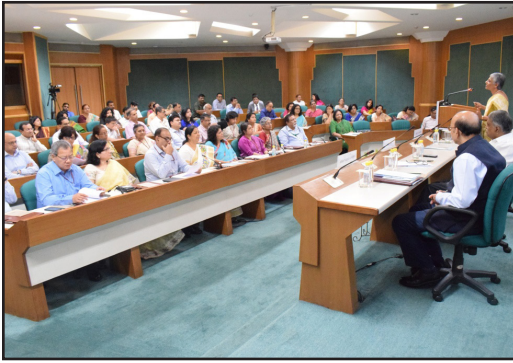
Workshop for Financial Advisors of Government of India