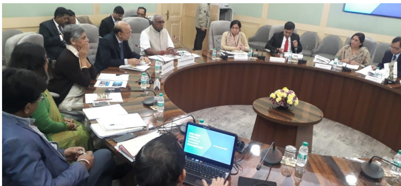
24th AGM of NIFM Society at North Block Delhi