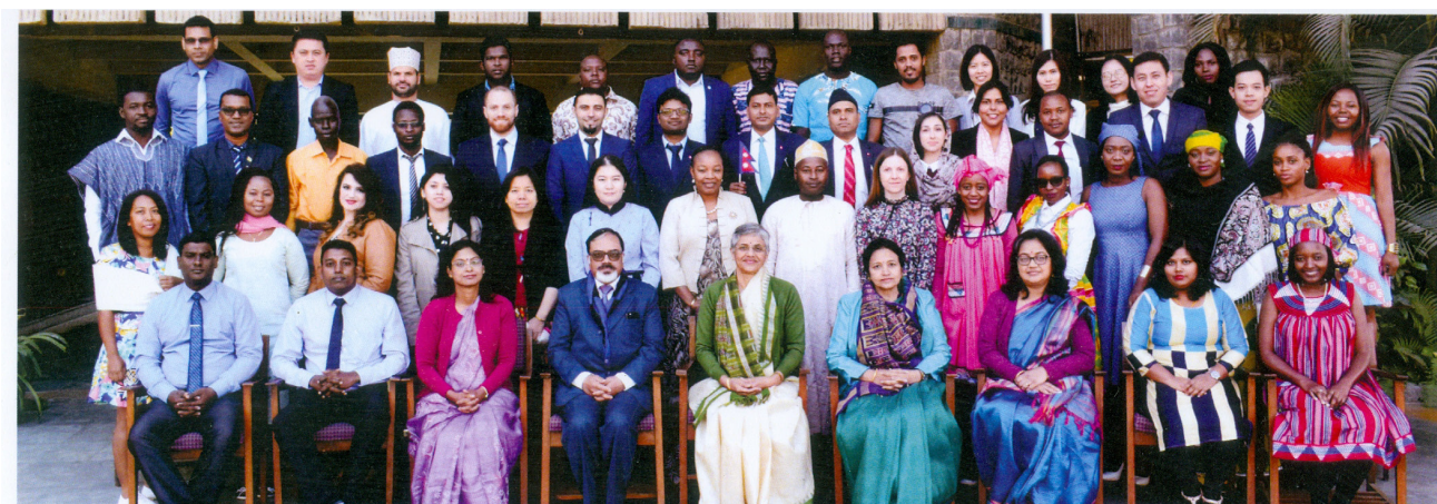
ITP on Budgeting, Accounting & Financial Management in Government Sector under ITEC Scheme of MEA, Government of India