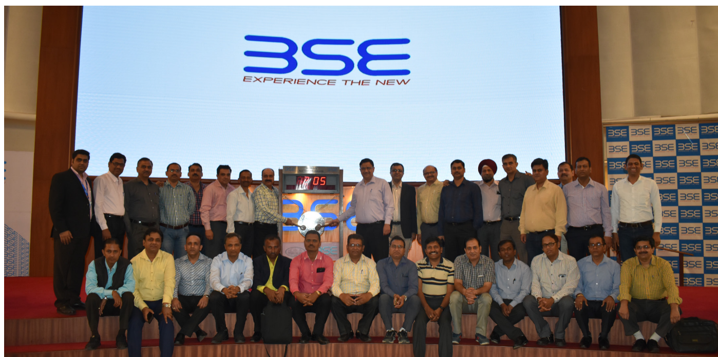
PGDM(FM) 2017-19 at Bombay Stock Exchange during Domestic Attachment