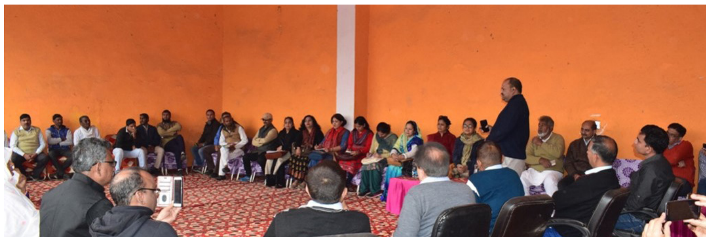
Activity during Village Visit of DGA&IA 2018-19