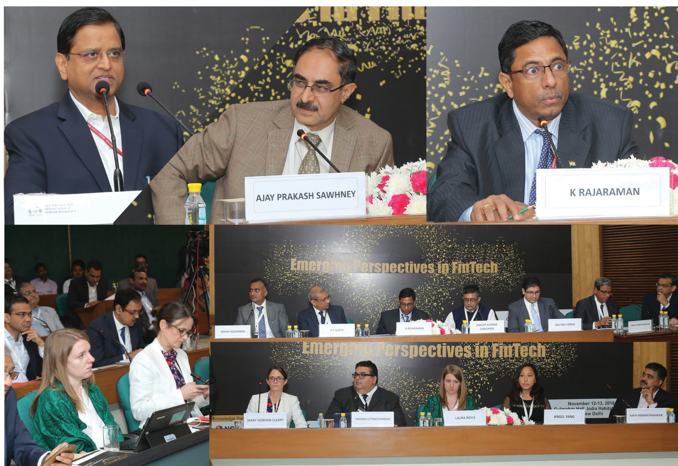
International Conference on Emerging Perspectives in Fintech

Various issues and challenges encompassing the Policy and Regulatory Framework for FinTech in India were deliberated during the two day conference. A number of papers covering FinTech related issues were presented by Entrepreneurs and Scholars on the first as well as second day of the conference. The deliberations at the conference were commended by the Steering Committee on Fintech and the Policy makers.